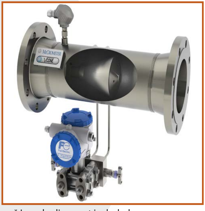
* Impulse lines not included

Lifespan of +25 years eliminates costly plant downtime