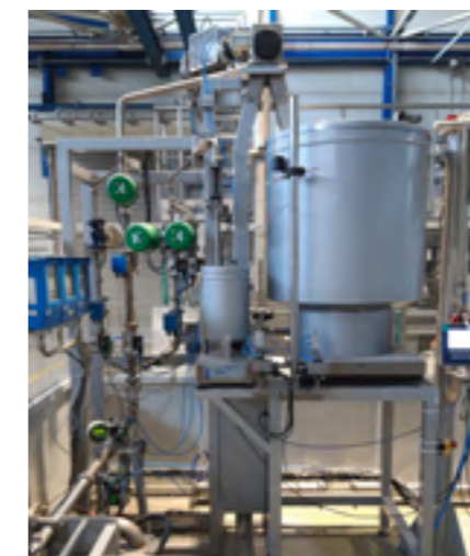
Electronic scale of the smallest bench