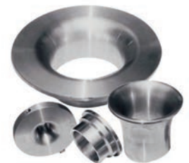
Venturis and Nozzles