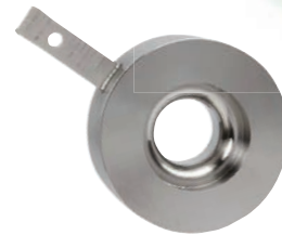
Orifice plates and corner taps