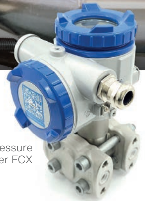
Differential pressure transmitter FCX

Design to outperform with FCX DP transmitters. Wet calibration available.