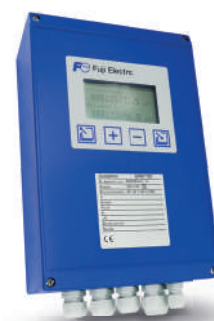
Energy calculator ERW700