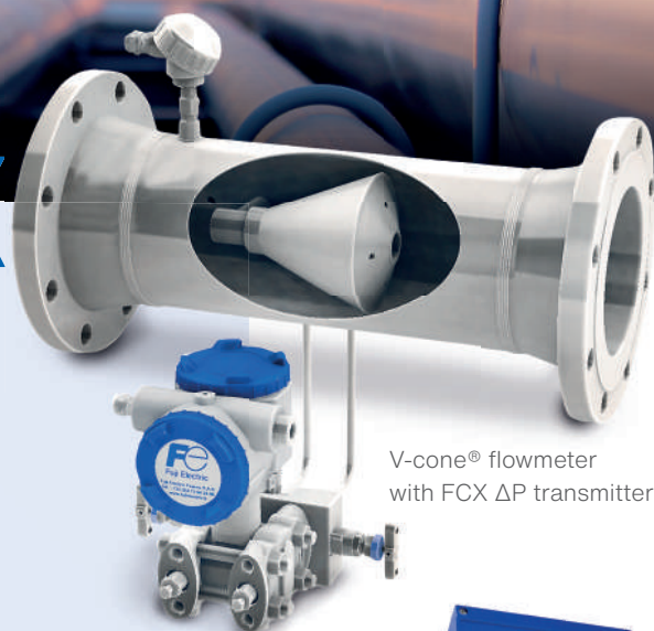
V-cone® flowmeter with FCX \Delta P transmitter

Lifetime of more than 25 years, calibration without production downtime